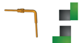
Mother board to Daughter board