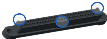
Molded LCP Polarized